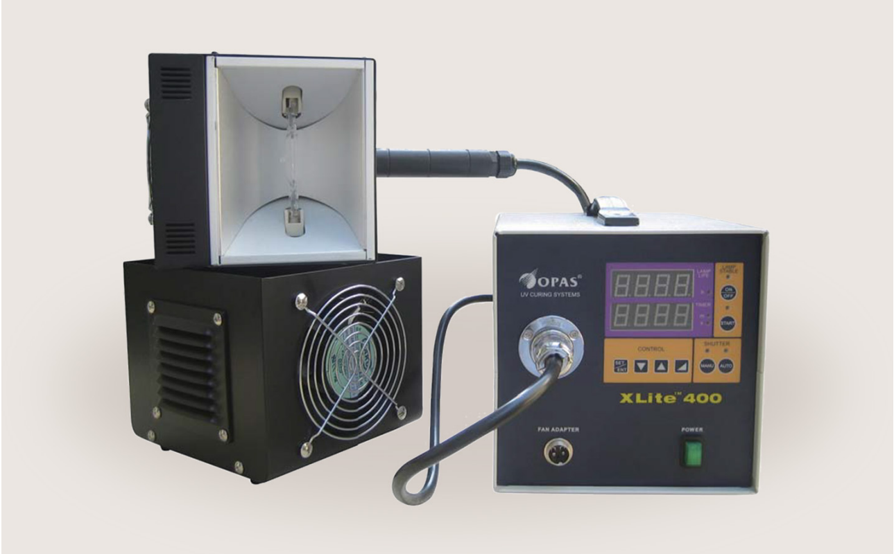
Model: OPAS XLite 400P